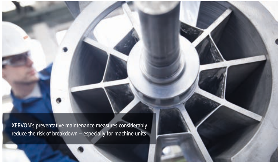
XERVON's preventative maintenance measures considerably reduce the risk of breakdown – especially for machine units

One of our specialties in this particular field is condition monitoring. We continuously monitor the life cycle of your machines so that you are not caught out by an individual machine part or a whole unit breaking down. By carrying out various types of offline and online measurement procedures – for example vibration and oil analyses, monitoring machines using remote system diagnostics or thermal radiation – our engineers are able to reach reliable conclusions