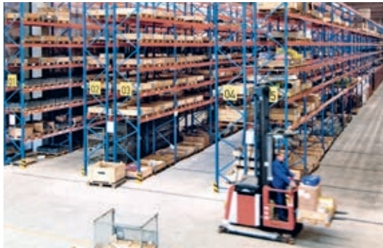
Our innovative MOLINA concept is used to manage stock levels at the state-of-the-art service and logistics centre in Lingen helping to free up the balance sheet

XERVON offers an alternative, cost-effective way of running and further developing your materials management system: being a full service provider we manage all your material-related processes and, if requested, your stocks, too. The primary aim of our materials management system is to ensure spare parts are readily available whilst keeping stock levels to a minimum – which we achieve thanks to our years of know-how, our strong networks and our novel concepts.